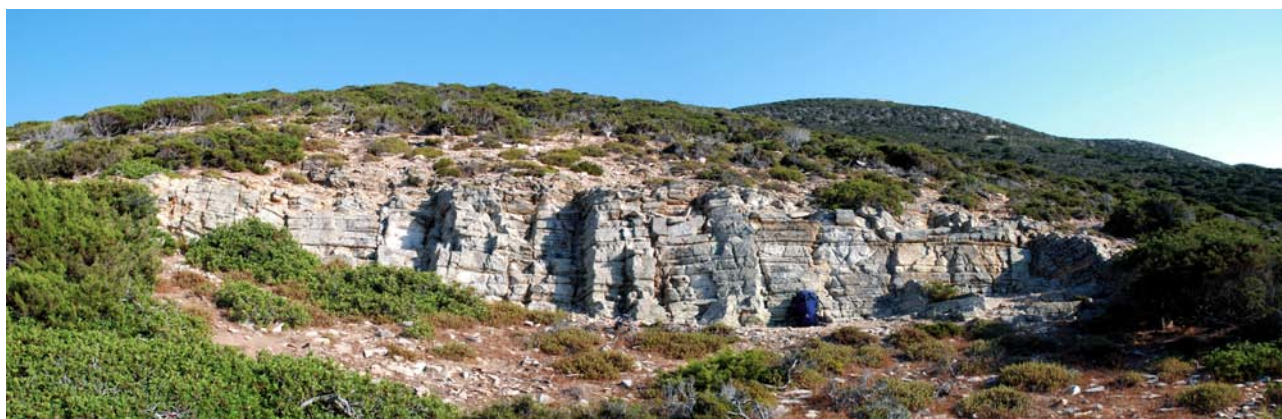
FIGURE 8: Overview photograph of the quarry in white mylonitic gneiss on the northern slope of Raches, 400 m west southwest of the sanctuary (for location see Figures 2 & 3). The quarry is about 16 m long and more than 2 m high. Back bag for scale.

With exception of marble 2 all rock types of the building stones in Building A of the sanctuary can be found on Despotiko