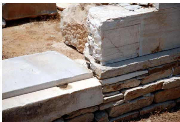
FIGURE 6: East wall of room A2. The large threshold on the left comprises the massive, coarse grained, slightly greyish marble 2. Marble 1 of the well dressed building stones of the east façade is easily distinguished by its well developed foliation and thin, rose-coloured dolomite layers. Foundation stones are made of white, strongly foliated, mylonitic gneiss. Several orange-brown coloured fractures indicate that the stones have been separated in the quarry along the fractures and these fracture surfaces have hardly been modified later (for colours see the online version of this paper).

In addition, modern Despotiko has usually been tentatively equated (e.g. Cramer, 1828, 406; Bursian 1872, 482-483; Kou-