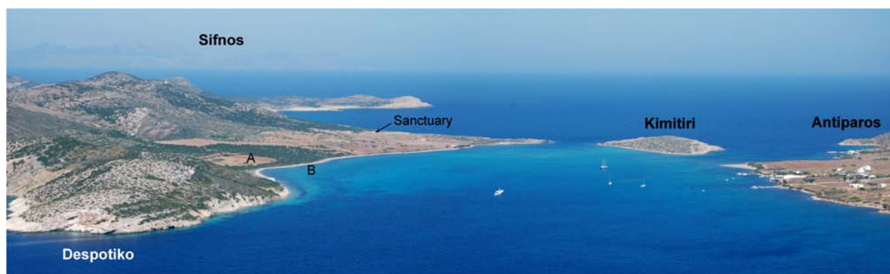
FIGURE 1: Overview of the Despotiko Bay. View towards west-northwest, showing, from left to right Despotiko, Kimitiri and Antiparos islands. The outline of Sifnos is vaguely visible in the left background. The location of the parallel trenches above sea-level is indicated by the letter "A", those under the present sea-level by "B".

Melting of continental ice and thermal expansion of sea-water since the Late Glacial Maximum (ca. 20,000 years ago) has raised the global sea-level by ca. 125 m (Chappell and Shackleton, 1986; Fleming et al., 1998; Caputo, 2007). On a