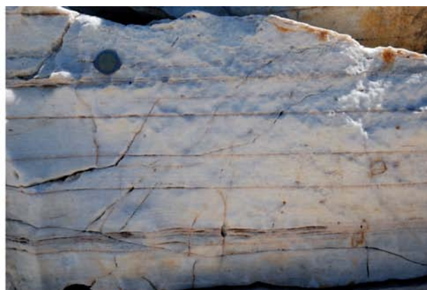
FIGURE 7: Comparison between building stones with outcrop lithologies on Despotiko. a) Two building stones from Building A consisting of marble 1 (centre and left part) from the east façade of room A1. Note the carefully dressed surfaces, the white, slightly greyish colour and especially the characteristic rose-coloured layers of fine grained dolomite marble. The building stones below and to the right comprise white mylonitic gneiss. b) Outcrop photograph of marble from Cape Koutsouros (for location see Figure 3), comprising white, medium grained calcite marble with well developed foliation and characteristic rose coloured, thin dolomite marble layers. Note the close similarity with marble 1 from Building A (for colours see the online version of this paper).