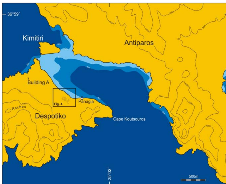
FIGURE 3: Topographic and bathymetric sketch map of Despotiko Bay. The location of Building A on Despotiko is indicated. The coastline, isolines and isobaths are from the 1:20,000 nautical chart (HNHS 1989); heights in metres above mean sea-level, depths under lowest low water. White (yellow in the online version) indicates land above present sea-level, light grey (light blue in the online version) denotes the outline of the isthmus between Antiparos and Despotiko at 2 m relative lowered sea-level and middle grey (blue in the online version) designates the shape of an isthmus at 5 m relatively lowered sea-level. All these reconstructions are based on present sea-bottom geometry, neglecting tectonic movements. Location of Figure 4 is indicated.

The inferior rock quality of the calcrete as building stone and the virtual lack of this rock type in the sanctuary makes interpretations of the trenches as a former quarry very unlikely on Despotiko. Further, the relative sea-level curve for the Cyclades by Poulos et al. (2009) indicates that the lowermost trenches were not submerged before Roman times and thus were constructed on dry land. Therefore interpretations linking the trenches, some of which would have been at least 12 m above sea-level, to sea-based activities (e.g. shipsheds, salt evaporation installations, aquaculture) are implausible. The