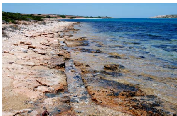
FIGURE 5: Photograph of one trench west of Panagia on Despotiko exposed by waves and currents. View towards northwest, towards the present farmstead. The trenches are some decimetres wide with quite regular, parallel and almost vertical sides. They have been cut into calcarenite; the lower part is not exposed.

Probable Early Bronze Age cist graves off Kimitiri, in 3 m water depths provide strong evidence for a land connection between Antiparos and Despotiko still at that time. A Classical marble inscription found at the excavation site of Mandra on Despotiko reading ΕΣΤΙΑΣ ΙΣΘΜΙΑΣ (Hestias Isthmias), which essentially means “for Hestia of the Isthmus”) may indicate that an isthmus still existed in Classical times (Kourayos, 2006) and probably even later, if the Hellenistic age (Morrison, 1968) of the viticulture trenches on Antiparos is also va-