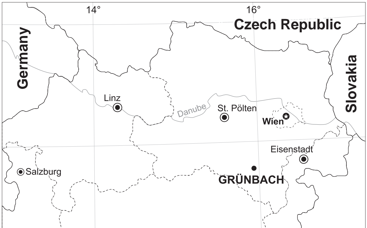
Fig. 1. Location of the Grünbach area in Austria

The Gosau Group of the Grünbach – Neue Welt area in the eastern part of the Northern Calcareous Alps forms an approximately 14 km long, deformed syncline of Upper Cretaceous to